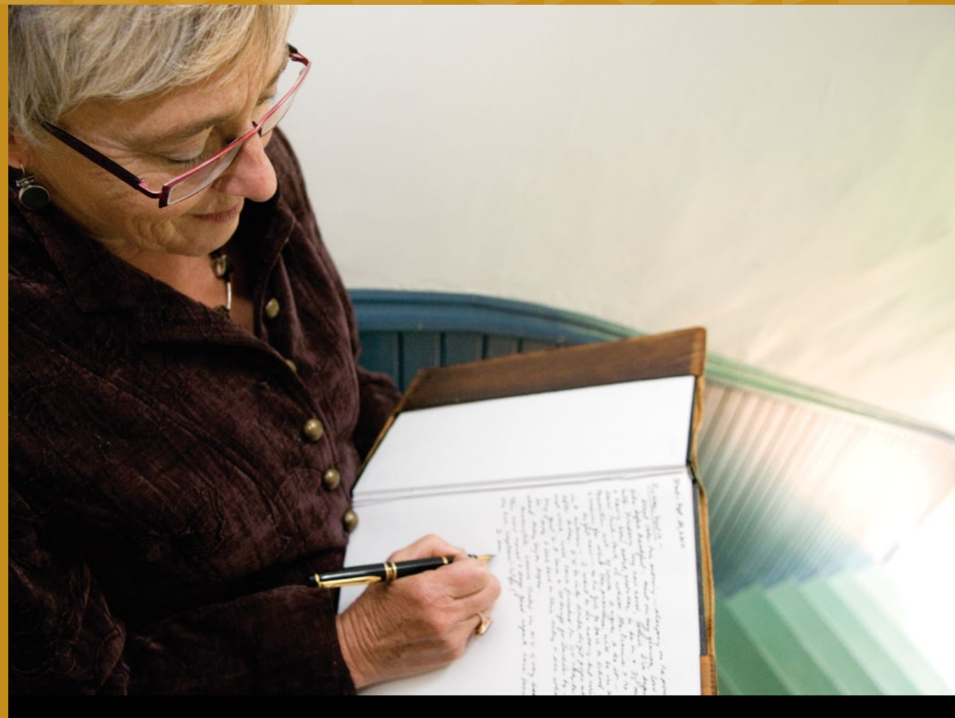
2010 LIEUTENANT-GOVERNOR'S AWARD for High Achievement in English Language Literary Arts